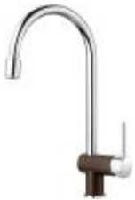
BLANCO RITA DUAL SPRAY