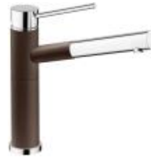
BLANCO ALTA DUAL SPRAY