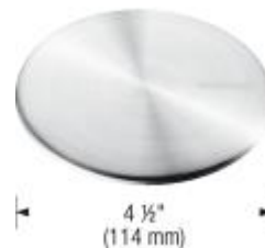
3 1/2" CapFlow strainer cover

Stainless steel (fits all BLANCO strainers)